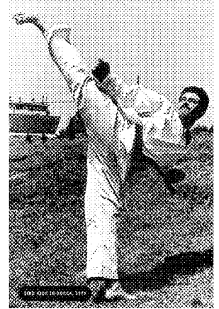
Black Belt Bernard Kerik

About that time, I became enthralled by the television show "The Green Hornet" which starred Bruce Lee as Kato. I started Martial Arts at a school near my home, in nearby Clifton, New Jersey, and I could feel right away that I had a talent for Martial Arts, that it was something I wanted – more than I had ever wanted anything in my life. I hadn't been into sports in school... with Martial Arts I found something that tapped into deep pools of strength and self-discipline that I was just beginning to discover in myself. By ninth grade I was devouring all the teachers had to offer.